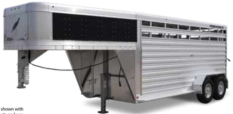
Shown: 16' model shown with optional black sheets and running boards.