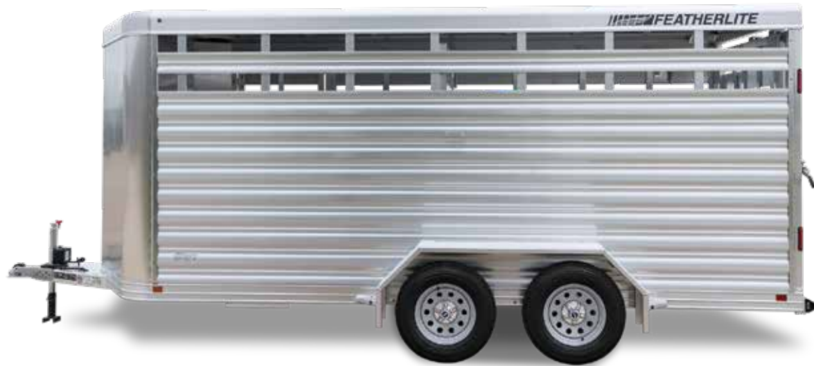
Shown: 16' model shown with optional spare tire.