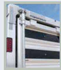
Heavy-duty rear hardware