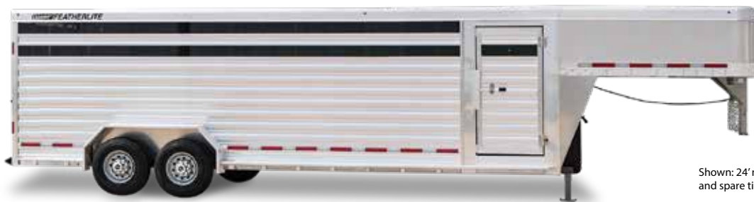
Shown: 24' model with plexiglass and spare tire option.