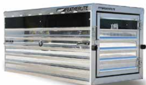
Shown: 7'6" long model with optional polished panels