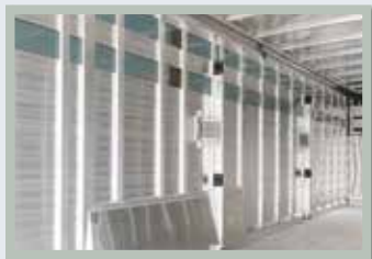
Side panels with smooth interior wall