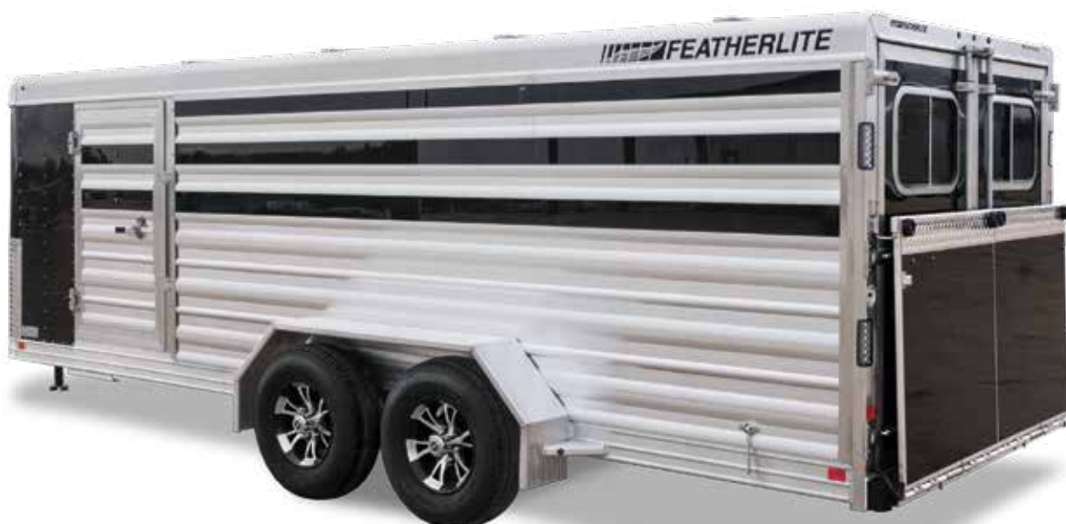
Shown: 16' low profile with plexiglass, rear ramp, black side sheets and other options.