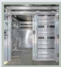
Optional Step Safe gates protect livestock