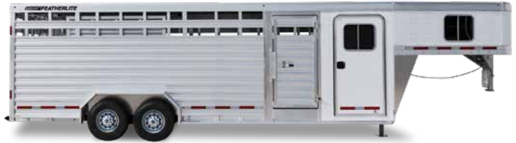
Shown: 24' model