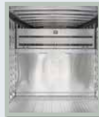
Brawny drop gate standard