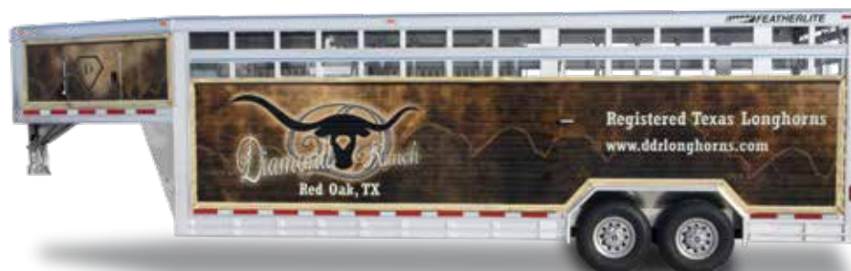
Custom graphics wraps are available on Featherlite stock trailers.