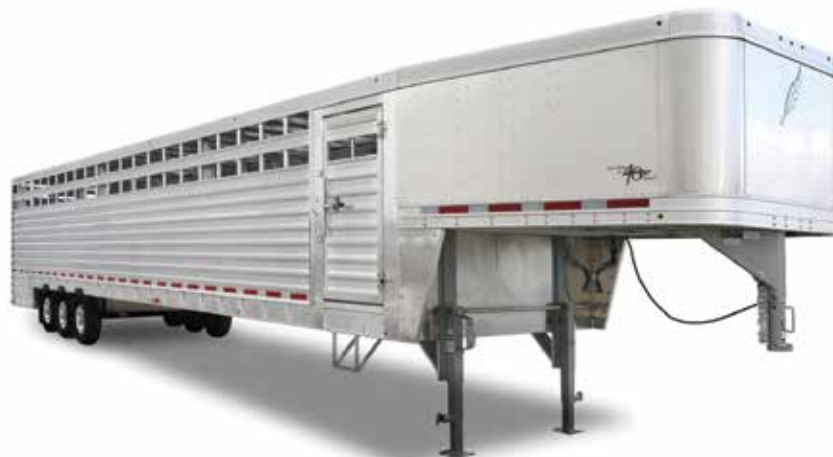
Shown: 40' with optional steps and additional lights.