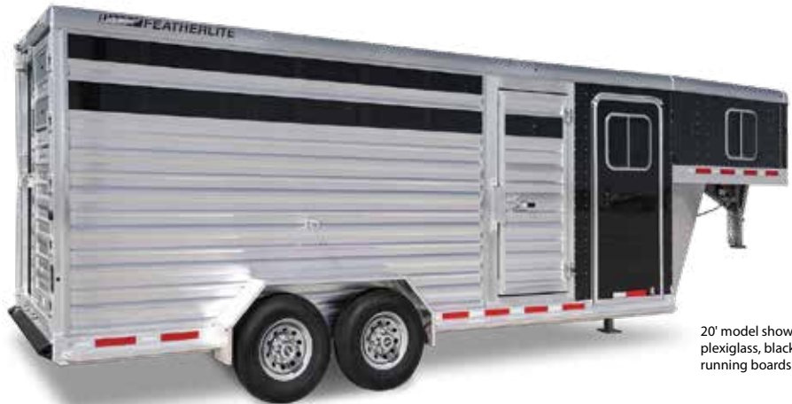
20' model shown with optional plexiglass, black side sheets and running boards.

Dimensions shown are approximate and may vary.