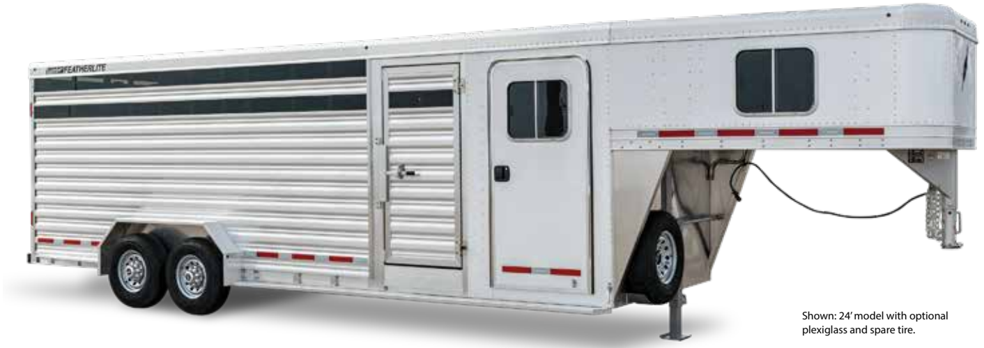
Shown: 24' model with optional plexiglass and spare tire.