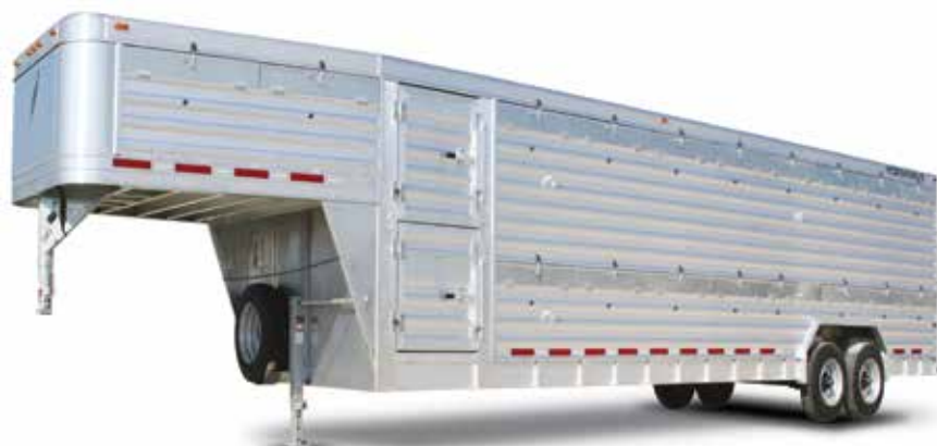
Shown with double deck option.