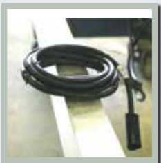
Wiring harness keeps wiring secure