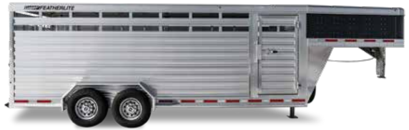
Shown: 20' model shown with optional black sheets and running boards.