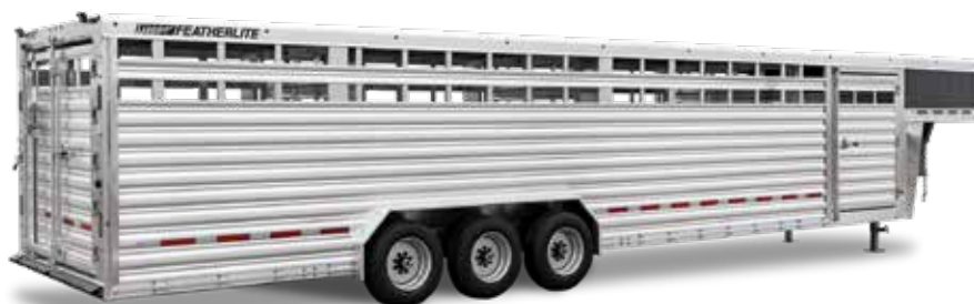
Shown: 34' model with 54" escape door, black sides sheets and more.