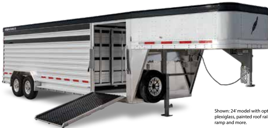
Shown: 24' model with optional plexiglass, painted roof rail, side ramp and more.