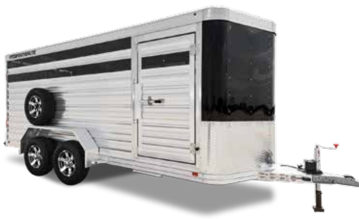
Shown: 16' model with optional plexiglass, black side sheets, spare tire and gravel guard.