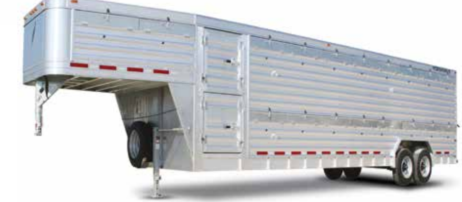
Shown with double deck option.