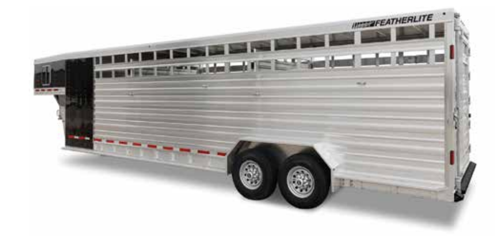
28' model shown with optional black side sheets.