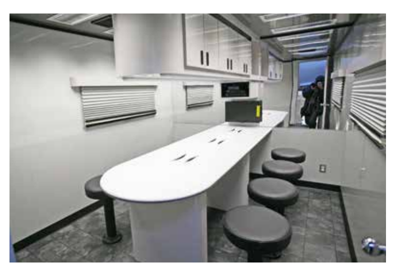
Conference tables allow officials to plan and be briefed during emergencies