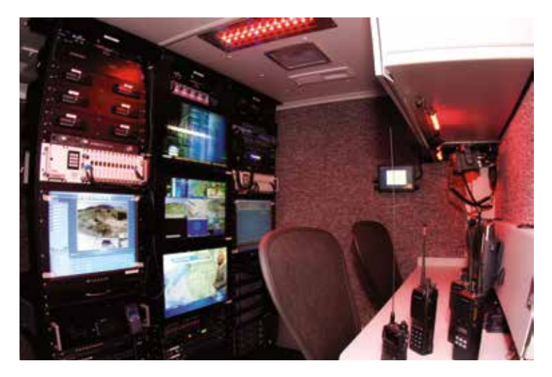
Communications/control centers are customizable inside command centers