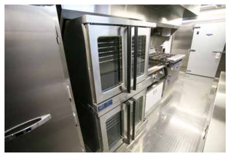
Kitchens allow officials to remain on the scene of a disaster for many days, serving staff, workers and community members