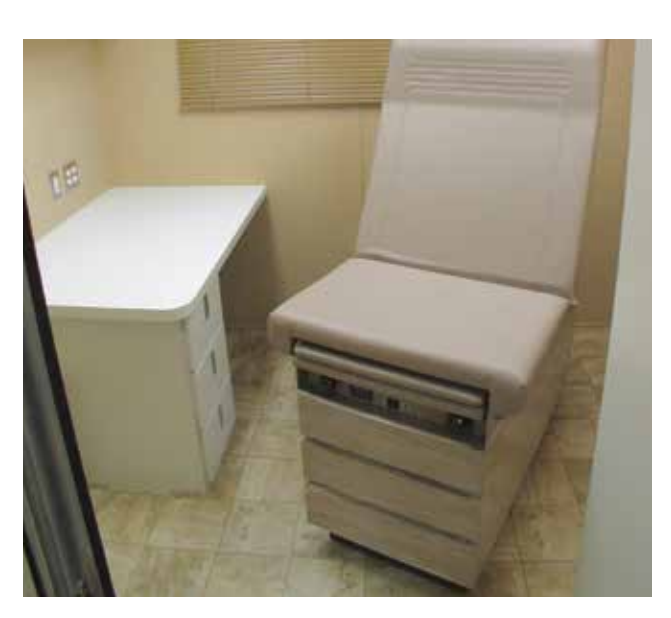
Exam room in a medical clinic trailer that serves patients off-site