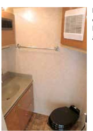
Restrooms of all kinds available