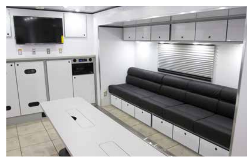
Slideouts expand your work or office space