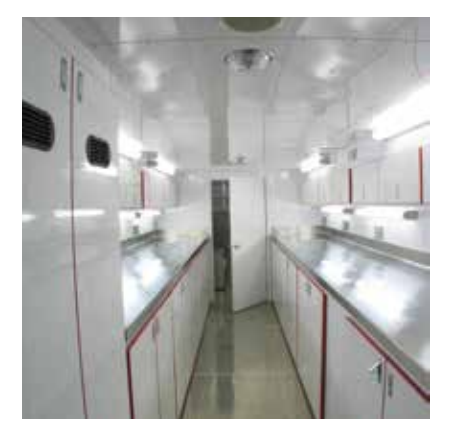
Functional work spaces offer smooth operation during emergencies