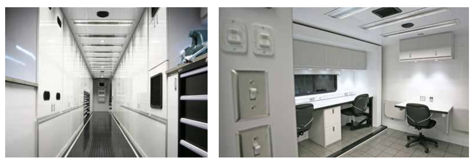
Unique storage options available