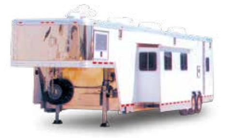
Animal Rabies Control