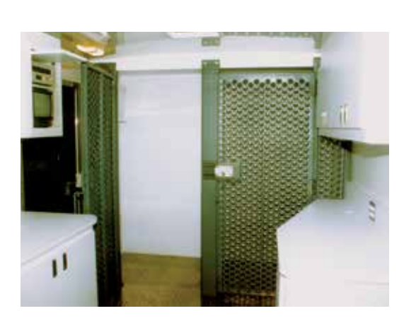
Mobile incarceration unit