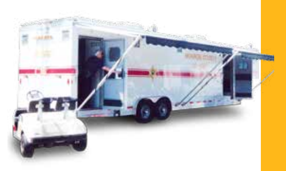
Mobile County Sheriff's Unit