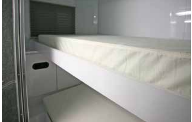
Bunk beds and other sleeping options available