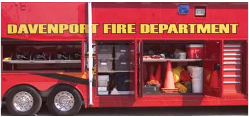
Large storage capacity accommodates all the necessary equipment on site