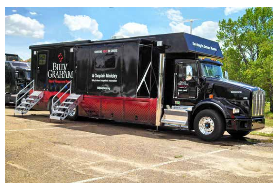
Disaster response or truck bodies allow organizations to respond quickly and deploy volunteers in times of disasters