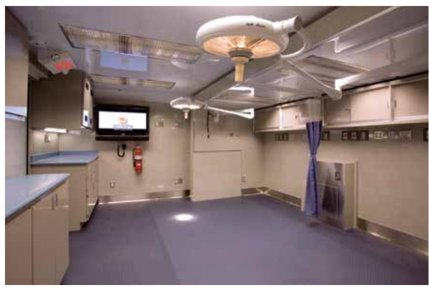
Medical trailers are customized to each hospital, clinic or company's need