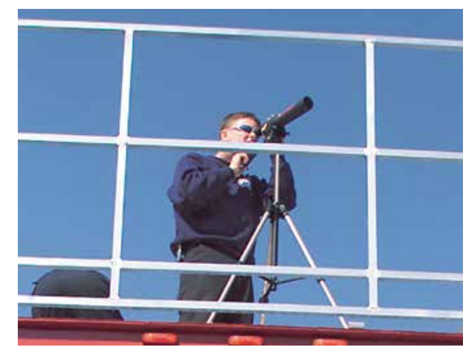
Observation decks offer additional space for assessing an emergency