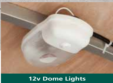
12v Dome Lights