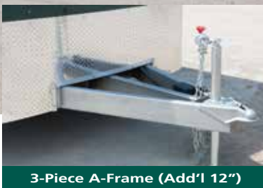
3-Piece A-Frame (Add'l 12")