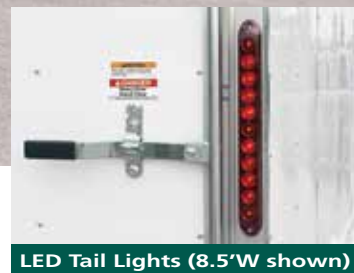
LED Tail Lights (8.5'W shown)