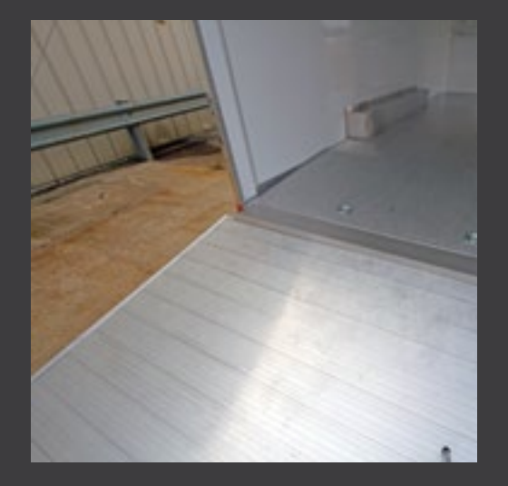
Rear ramp door with covered, continuous hinge