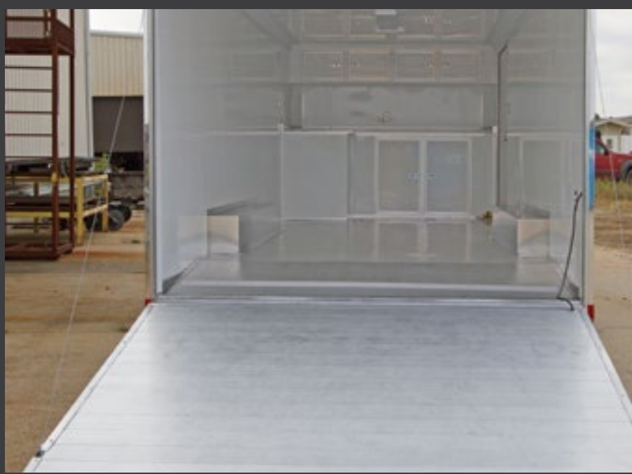
Best-in-class ramp door opening and width between wheel wells