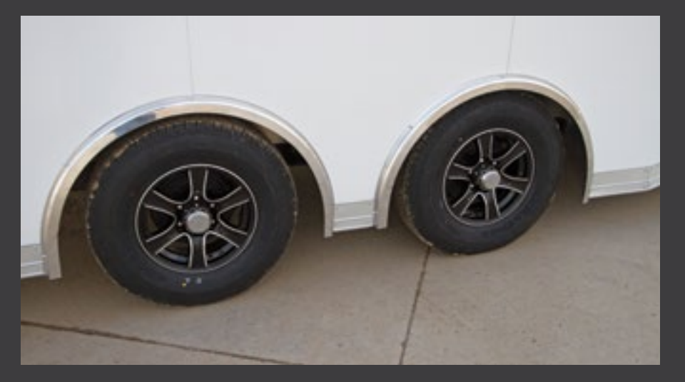
Spread axles handle heavier loads