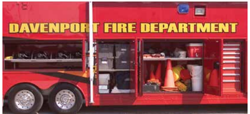
Large storage capacity accommodates all the necessary equipment on site