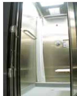
Self-containing trailers can include showers