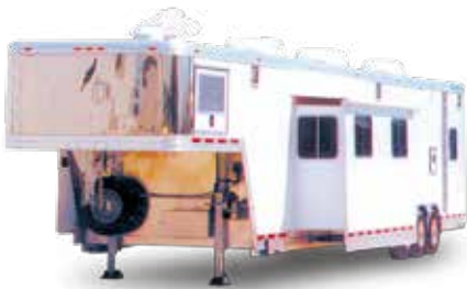
Animal Rabies Control