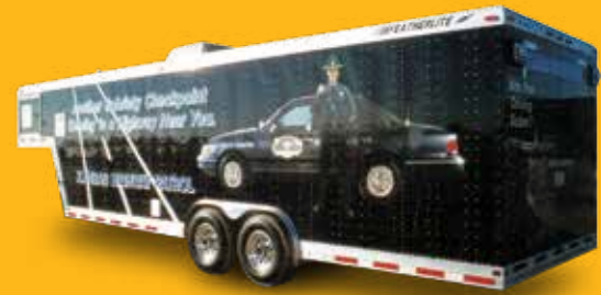
Mobile Law Enforcement