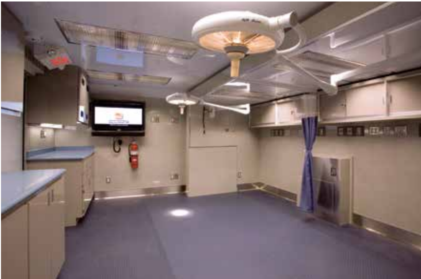
Medical trailers are customized to each hospital, clinic or company's need