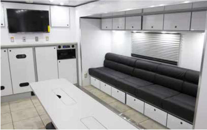
Slideouts expand your work or office space