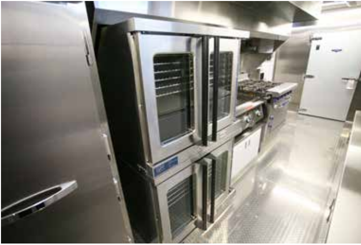
Kitchens allow officials to remain on the scene of a disaster for many days, serving staff, workers and community members