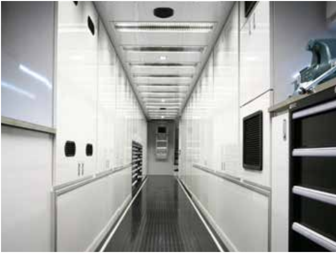
Unique storage options available