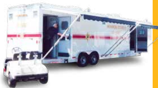
Mobile County Sheriff's Unit