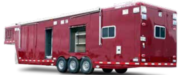
Mobile HazMat Response