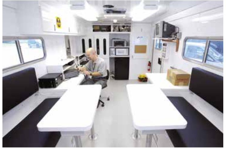
Mobile offices permit officials to work on site at a disaster