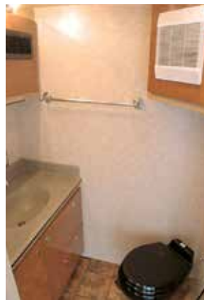
Restrooms of all kinds available