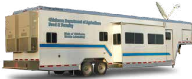
Mobile Agricultural Lab