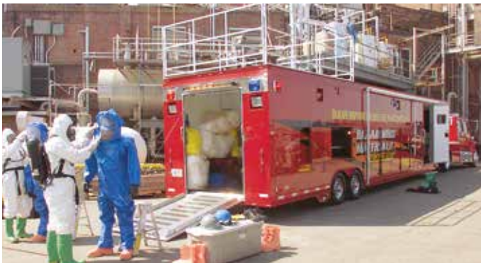
Mobile hazardous materials units allow the storage of all necessary equipment so your team can respond quickly