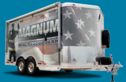
Mobile Mine Rescue Unit