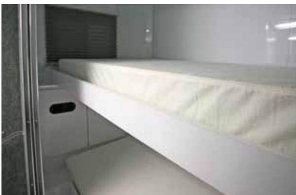
Bunk beds and other sleeping options available