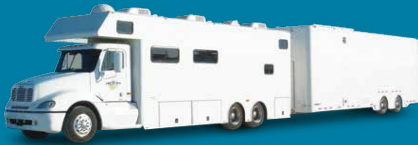
Custom Truck Body and Trailer