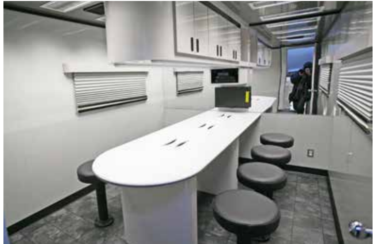
Conference tables allow officials to plan and be briefed during emergencies