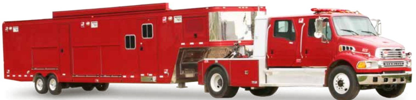
Mobile HazMat Response