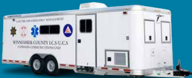
Mobile Command Center