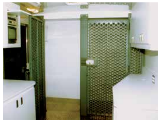
Mobile incarceration unit