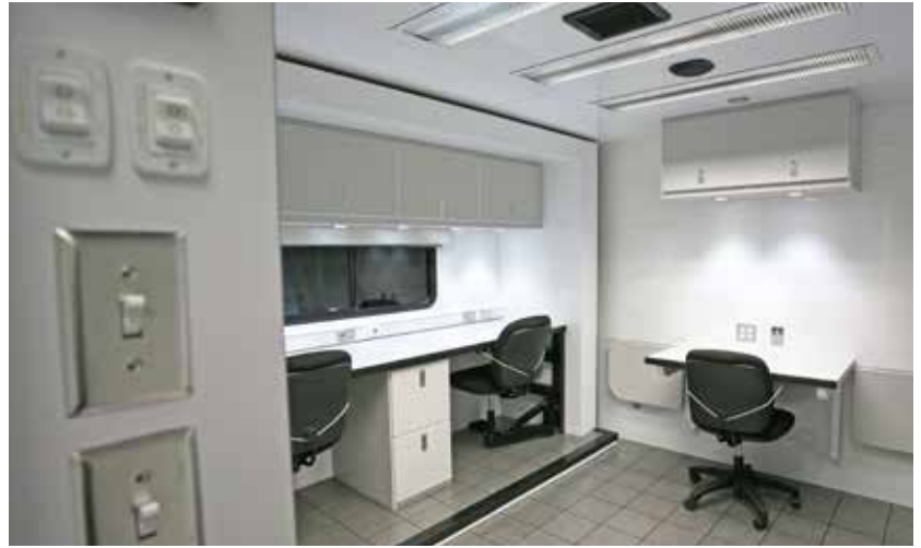
Slideouts expand work areas