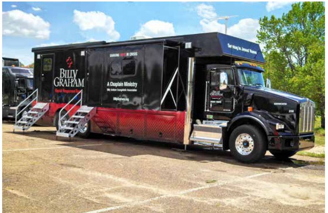
Disaster response or truck bodies allow organizations to respond quickly and deploy volunteers in times of disasters