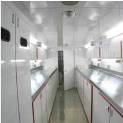
Functional work spaces offer smooth operation during emergencies