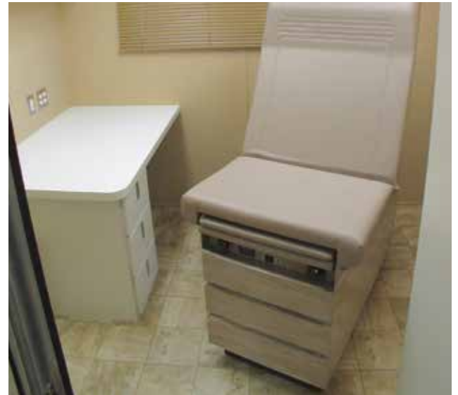
Exam room in a medical clinic trailer that serves patients off-site