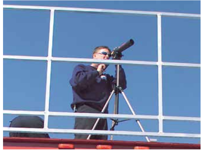
Observation decks offer additional space for assessing an emergency