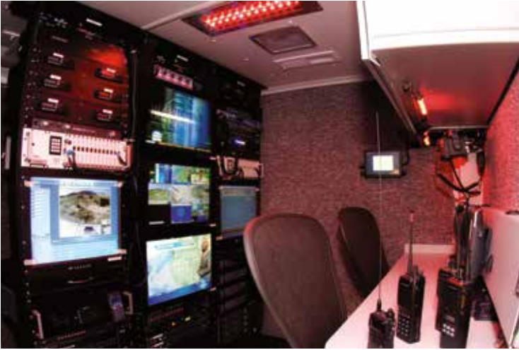
Communications/control centers are customizable inside command centers